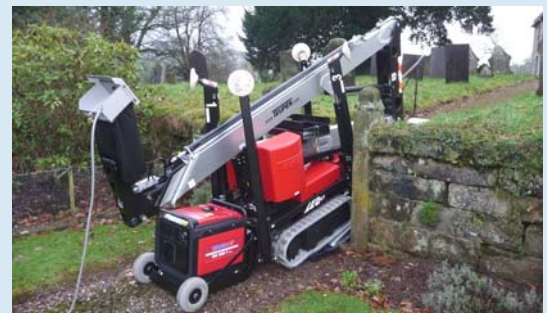
The basket is easily detachable for passing narrow entrances. The cable remote control offers a better overview when operating the track drive.