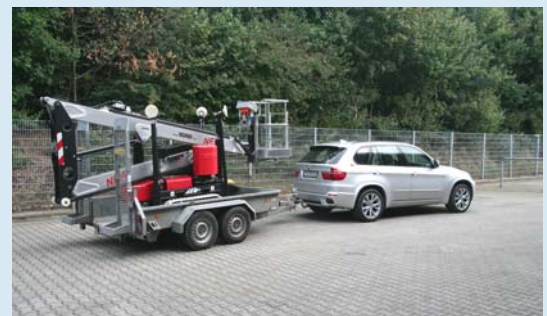
The light and compact LEO13GT is easily towed on standard trailers. On the jobsite it is easily set up with the automatic leveling system.

LEO = Model, Number = Metric Working height, G = Articulated, T = Telescopic, S = Standard, O = Optional