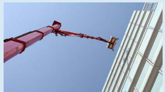
With its outstanding versatility the LE050GTX is the perfect tool to complete jobs quicker, safer and more efficiently.