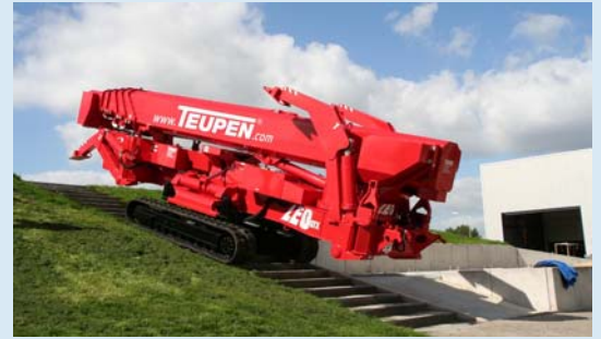
On the powerful track drive the LE050GTX can be manoeuvred on delicate floor types as well as in rough terrain. It even allows the machine climb steep slopes and stairs.