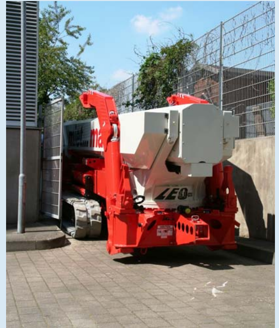
The LE050GTX can be easily and precisely manoeuvred through doorways, narrow alleys or around obstacles.