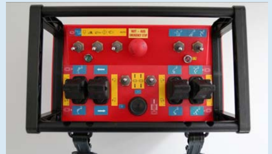
All functions are controlled from the radio remote controls. A clearly arranged control panel with color coded functions supports intuitive and safe handling.

LEO = Model, Number = Metric working height, G = Articulated, T = Telescopic, X = 400 kg basket load